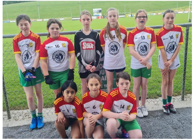
Our boys and girls football teams (sporting our new Rory Gallagher Festival sponsored kit) who represented the school at a recent Cumann na mBunscoil blitz in Ballintra.